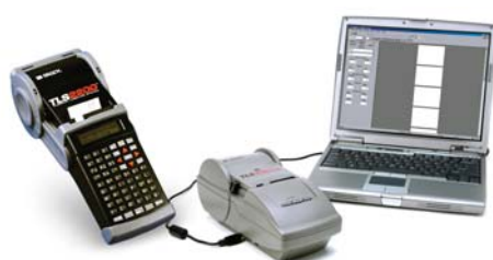
TLS 2200™ and TLS-PC Link™ Thermal Labeling Systems

Versatile, heavy-duty Brady printers that make the most of your software's capabilities.