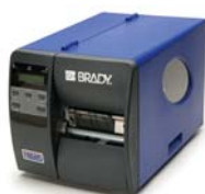
Tagus™ T300 Thermal Transfer Printer