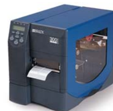
300MVP Thermal Transfer Printer

To order LabelMark™ V3 Labeling Software, go to www.bradyid.com/labelmark or call 1-888-272-3940.