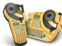
IDXPert™ Handheld Labels