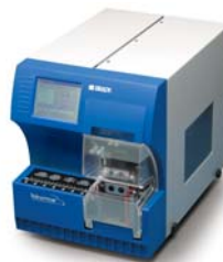
Wraprotor™ Wire ID Printer Applicator